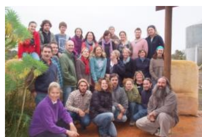
Permaculture Design Certificate WEB 2023